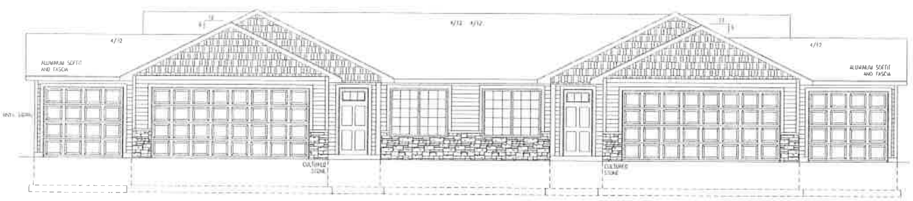
FRONT ELEVATION SCALE=1/4"

Bigelow and Lennon Construction, LLC 211 1st St. SW Byron, MN 55920