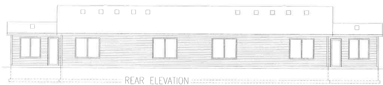
REAR ELEVATION SCALE=1/4"