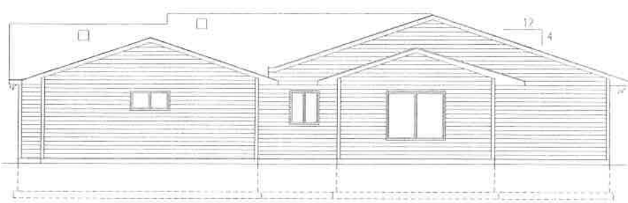
SIDE ELEVATION SCALE=1/4"