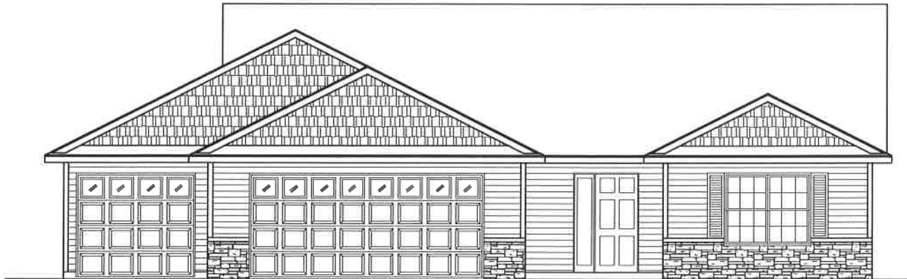
FRONT ELEVATION SCALE 1/4"=1'-0"

Bigelow and Lennon Construction, LLC 211 1st St. SW Byron, MN 55920