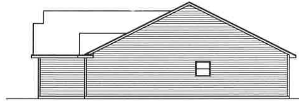
RIGHT ELEVATION SCALE 1/8"=1'-0"